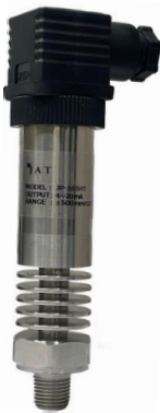
High Temperature type KC-8100HT Series